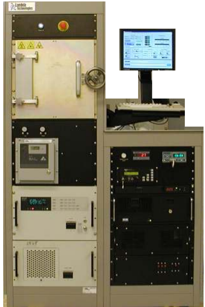
MC3100 configured with 2KW HPA for higher power applications