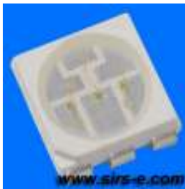
Single LED to be encapsulated

Light-emitting diodes (LED) are semiconductor diodes that emit light when an electrical current is applied in the forward direction of the device. LED packaging materials applied over the device must be cured to enhance the light transmission, reliability and longevity of a device.